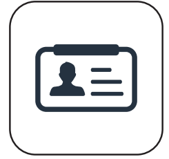
ID card recognition module