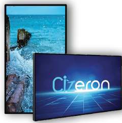
Wall Mount Signage