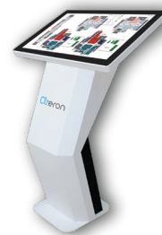
Way Finding Kiosk