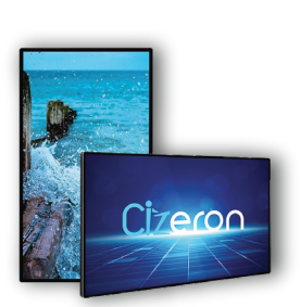
Wall Mount Signage